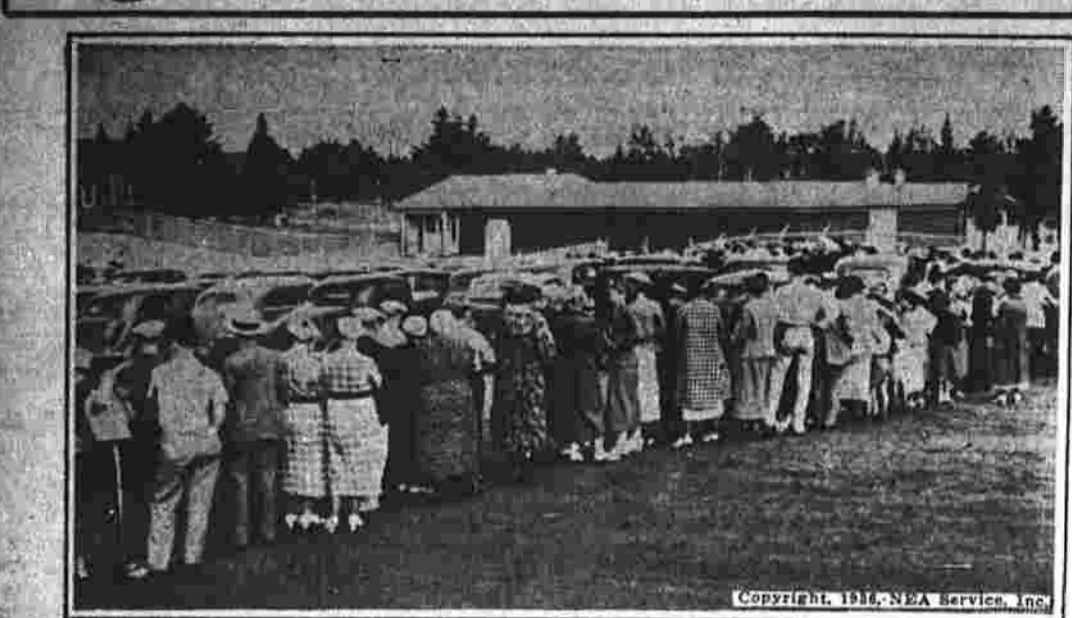
From all the 48 states of the Union and from every province of Canada they come, impelled by one urge—to see the world's most precious stone. This is a typical summer-day lineup, waiting to enter through the new recreation observation building, seen in the background, to watch the Dionne quintuplets at play in their sandpile and wading pool. From behind aluminum-enclosed screens, visitors watch the quintuplets get not one disturbing peep at their thousands of admirers.